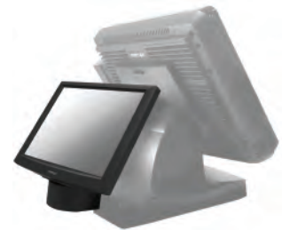
Rear mount bracket for optional 2nd display (LM6101C)