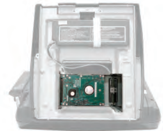
Built-in removable 2.5" HDD in Base Stand