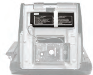
Optional built-in battery