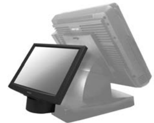
Rear mount bracket for optional 12" 2nd display (LM6000 Series)