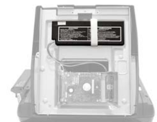
Optional built-in battery