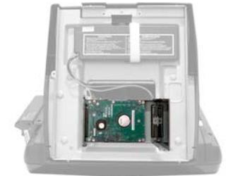
Built-in removable 2.5" HDD in base stand