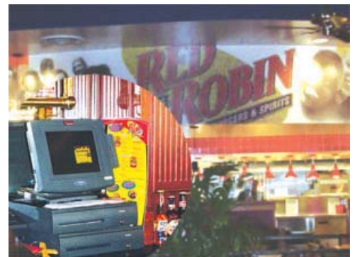
JIVA 6015 with Magnetic Stripe Reader and CR4100 Cash Drawer