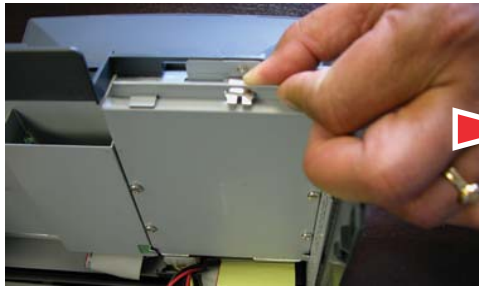
Press metal spring clip to access hard drive