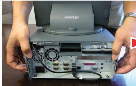
Press buttons on each side of metal chassis and to lift system cover