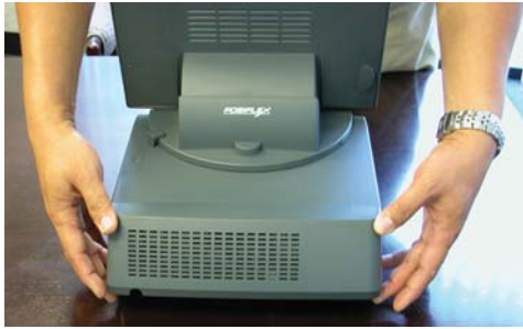
Place finger underneath each corner of rear cable cover and remove