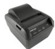
PP8000 [2-in-1: Serial / Parallel; OR 3-in-1: Serial / Parallel / USB or LAN]

High speed, high resolution thermal printing